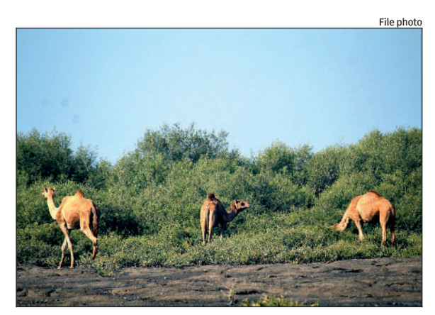
Plea filed by Kachch Camel Breeders Association seeking execution of September 11, 2019 order of the tribunal

"Let further steps be taken for enforcement of order of this tribunal dated September 11, 2019. The amount determined be recovered expeditiously and restoration