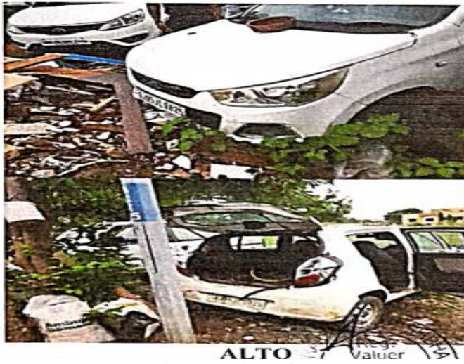
ALTO MARUTI ALTO