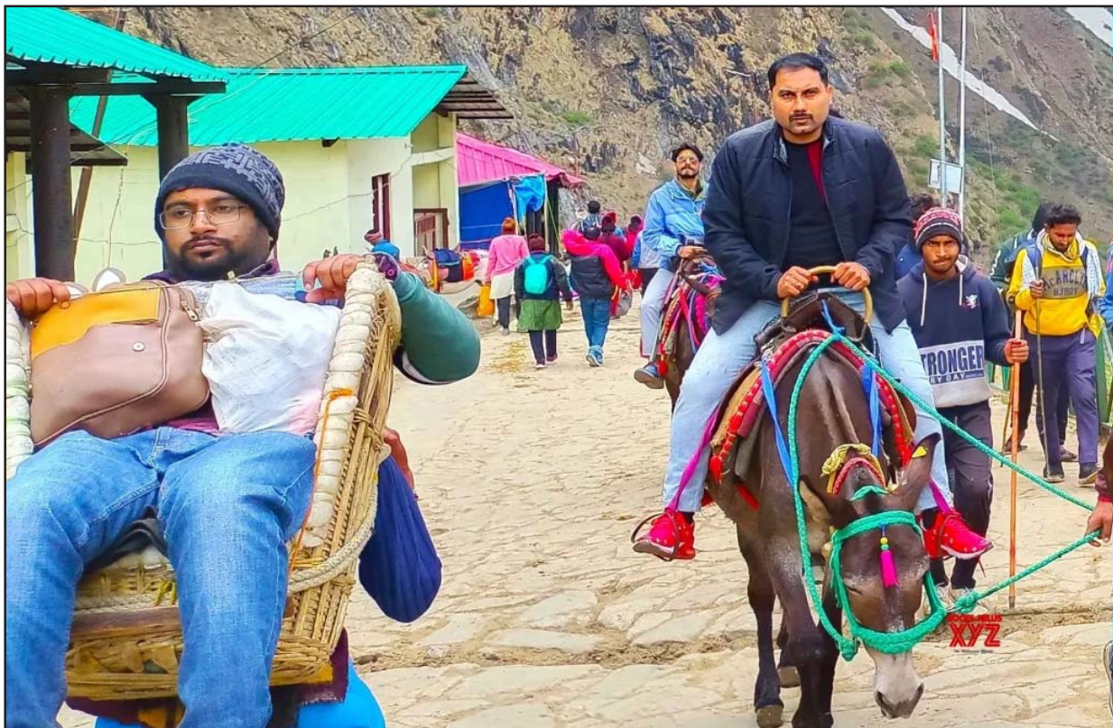
Uttarakhand: Hindu pilgrims on their way to offer prayers at Kedarnath Temple during Char Dham Yatra, in Uttarakhand on Friday, May 13, 2022. —IANS

Dehradun: After an unprecedented number of devotees turned up at the Kedarnath Temple, one of the Char Dhams in Uttarakhand, the Indo-Tibetan Border Force (ITBP) was deployed for crowd management on Friday.